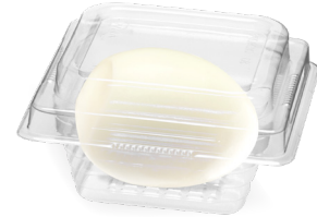
21482 / Lid - 21482L