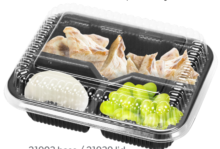
21903 base / 21939 lid Pg. 7