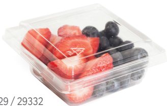
29829 / 29332