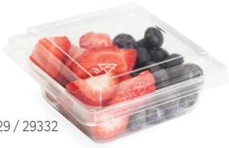
21829 / 29332