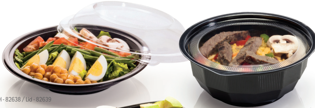
Bowl - 82638 / Lid - 82639

WNA™ Atrium™ bowls are stylish options that offer a retail look which enhances presentation and visibility. PETE suitable for cold food only. Check with your local recycling facility to ensure these containers will be accepted.