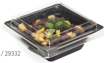
21929 / 29332