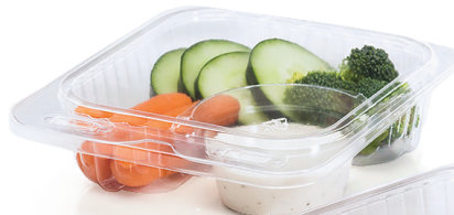
21929 / 29332