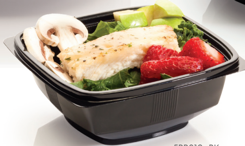
5BB012 - BK