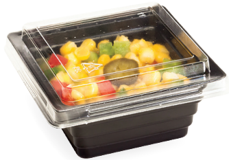
21860 / Lid - 29332