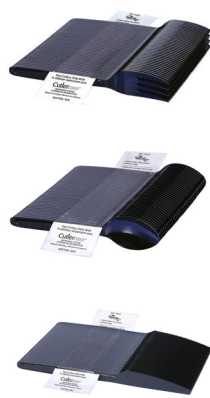
CUTLERY REFILL PACKS