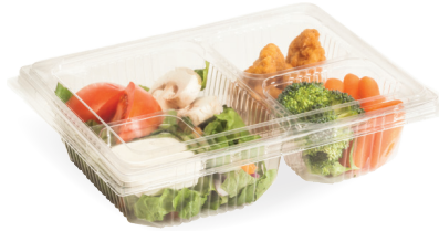
Tray - 82723 / Lid - 82725

Entrée and meal trays are ideal for your larger reimbursable meals, vending machines and complete meal solutions. Suitable for warm and cold foods. Check with your local recycling facility to ensure these containers will be accepted.